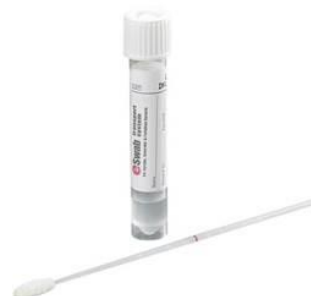
eSwab- Preferred collection device