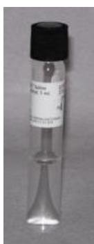
M4 Transport Media