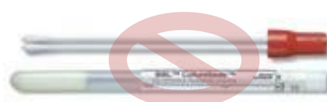
Standard culture swab (double)