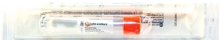
Abbott Multi-collect Device (urine or enclosed swab)