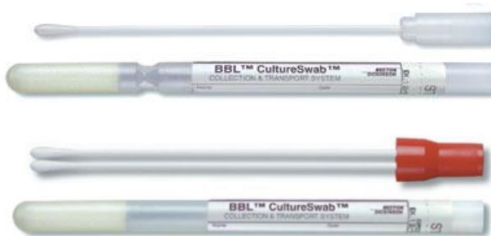
General use culture swab (single or double*)