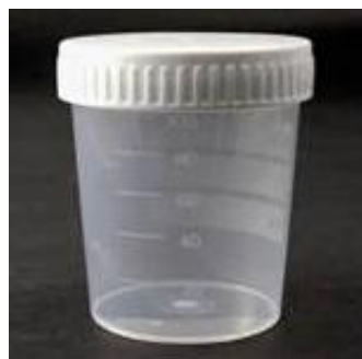
Wide-mouth leak-proof container Inpatients