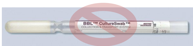
Standard culture swab (single)