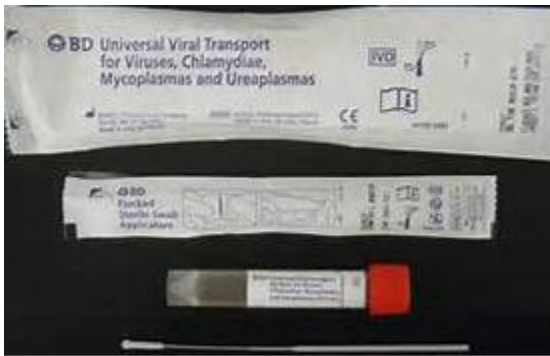
BD Universal Transport Kit (includes swab)