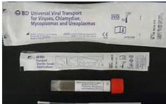
BD Universal Transport Kit (includes swab)