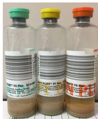
BacT Alert Blood bottles (peritoneal and joint fluids ONLY)