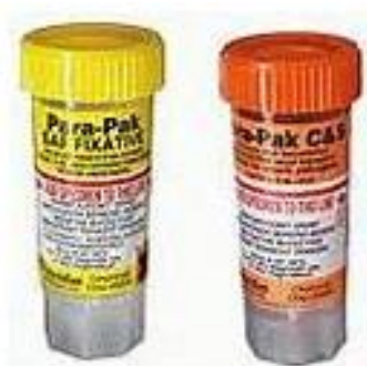
SAF (yellow) and Carey Blair (Orange) Para-Paks Outpatients