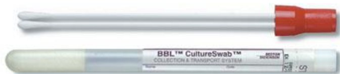
General use Dual shaft Culture swab