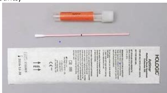
APTIMA Multitest Swab Collection vial.