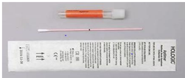
Aptima Multi Test Swab Collection Tube