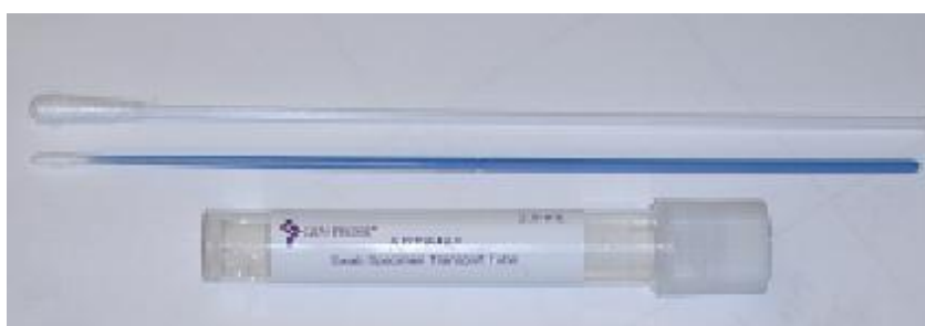
Gen-Probe Aptima Swab Collection Tube