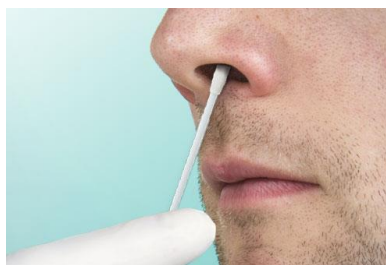
Method of Collection – Anterior nares