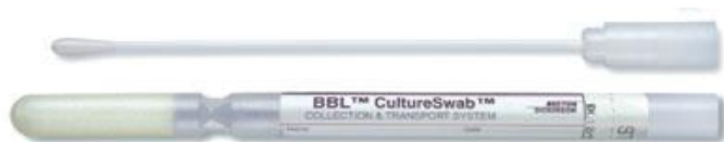
General use culture swab

Consider decontamination of commensal organisms prior to swabbing