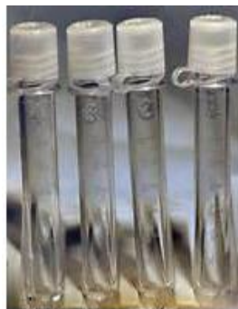
CSF Fluid Tubes

Specify whether sample is from ventricles or lumbar puncture