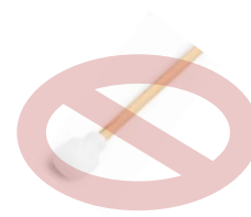
Wooden shaft swab