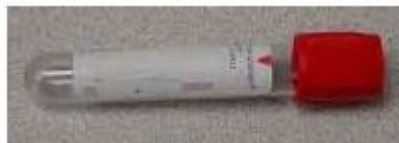
Red top Vacutainer Tube