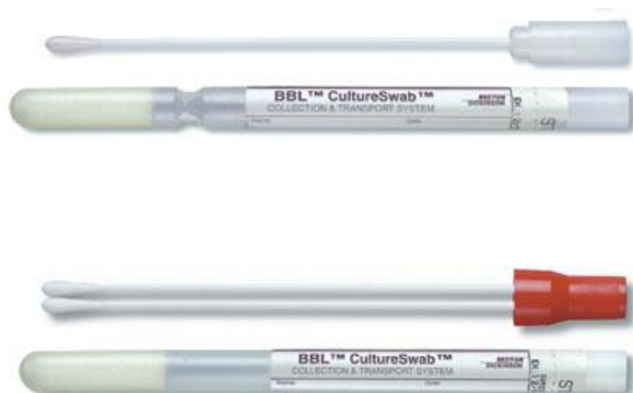
Standard Culture Swab