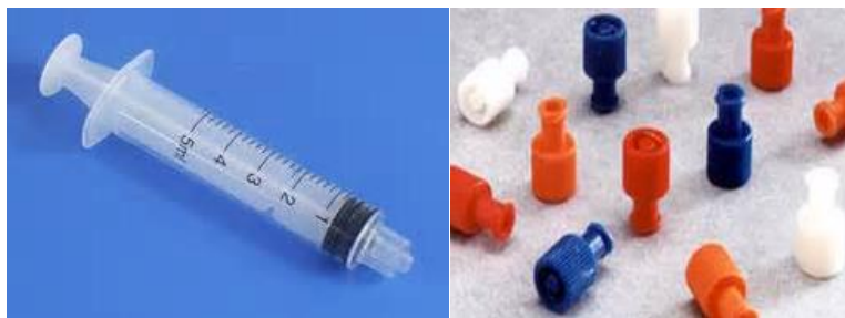
Syringe chamber, capped with needles removed

All containers labeled with contents and collection site