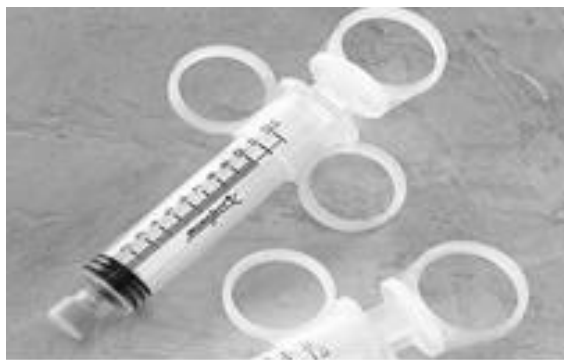
Nasopharyngeal Aspirate Device